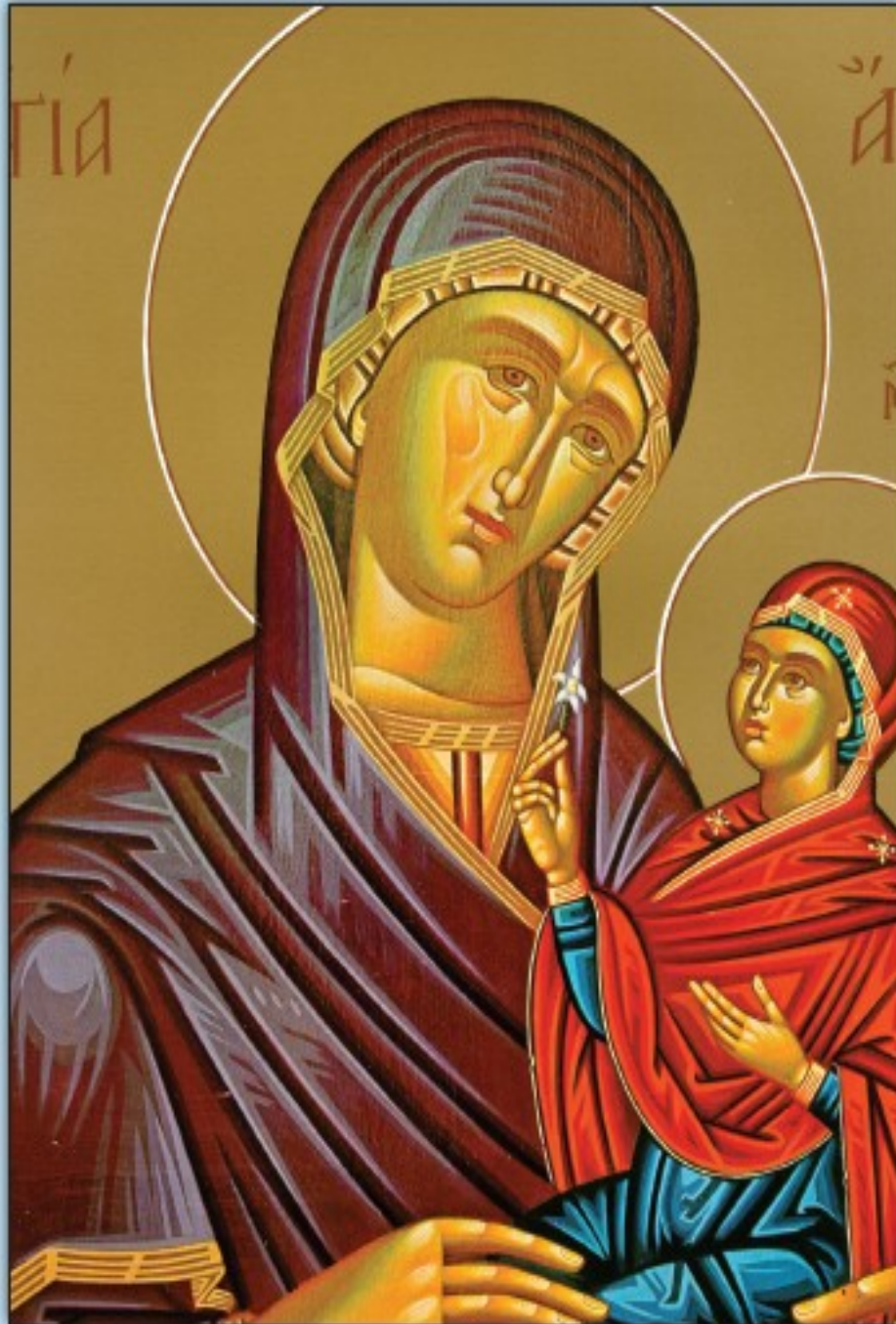
Icon of Saint Anna and the Mother of God