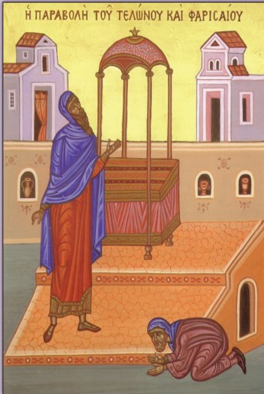
Icon of the Publican and Pharisee