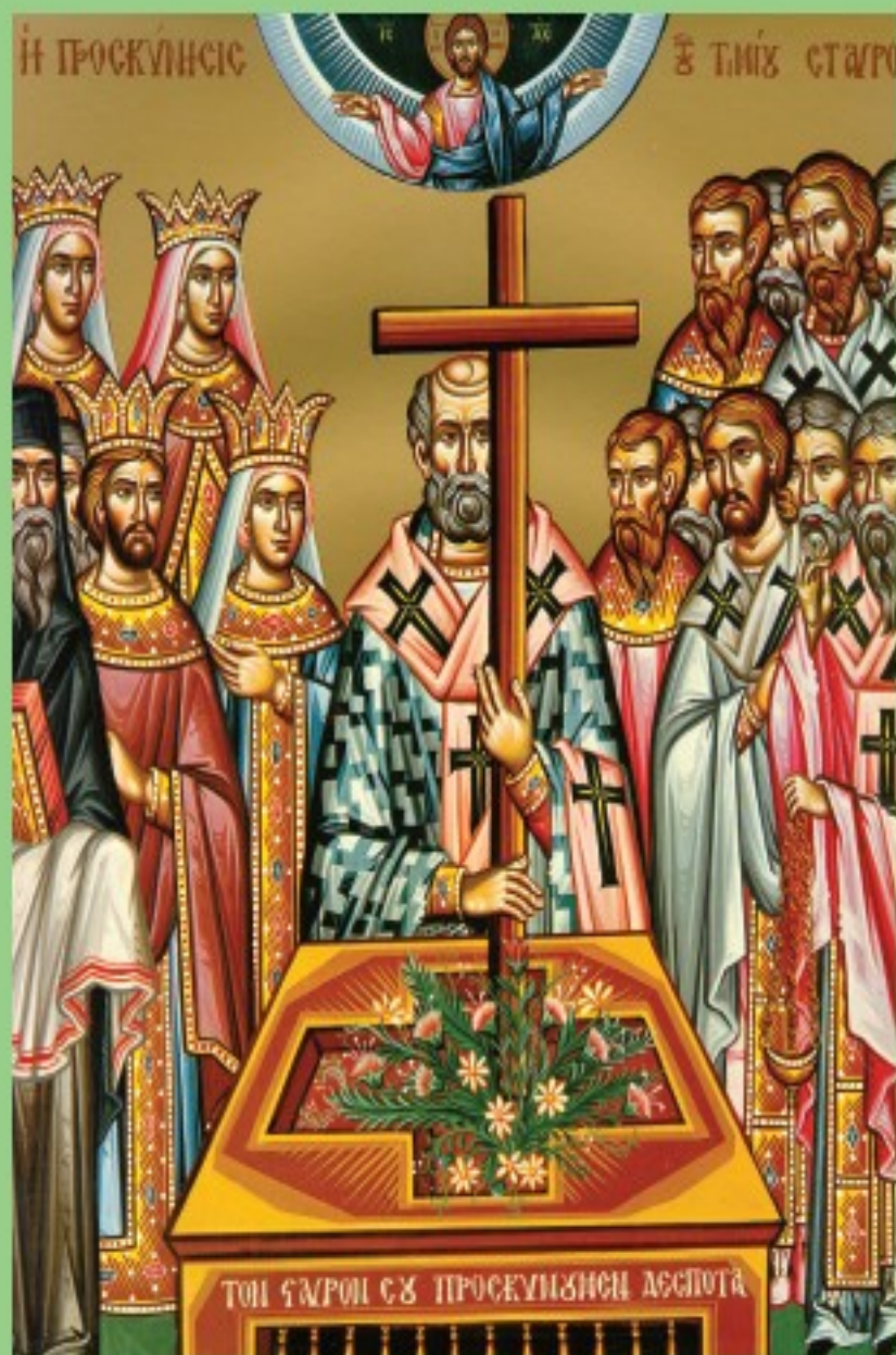
Icon of the Veneration of the Holy Cross